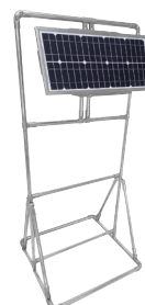
SolarPak Charger (optional)