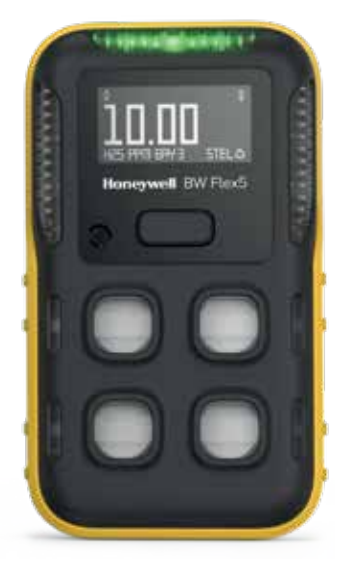
One of the smallest, lightest 5-gas portables on the market. <u>See page 7</u>

Serviceable 5-gas detector with a choice of more than 15 sensors