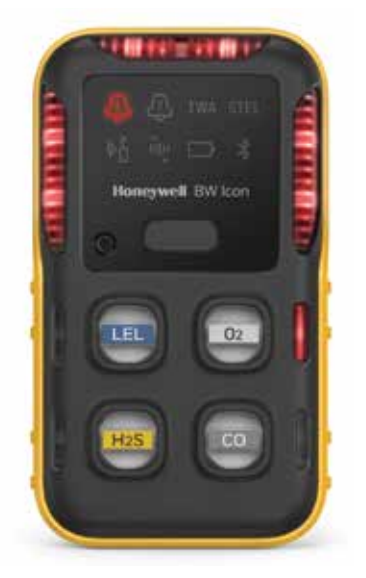
The first icon-based display for quick decisions – and training. <u>See page 6</u>

Fixed-life, 2-year, 4-gas detector for the hazards workers face most often