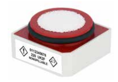
1 Series – the highest standard of sensor quality and reliability

So no matter how harsh the setting, workers will be alerted to gas hazards so they can leave the area.